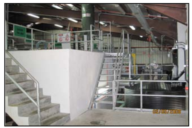
▲ Indoor UASB reactor in Food Processing Plant, Subang Jaya

UASB is very efficient in treating organic wastewater without energy consumption in the bioactivities. Organics are degraded and the biogas generated can be used as source of energy renewal.