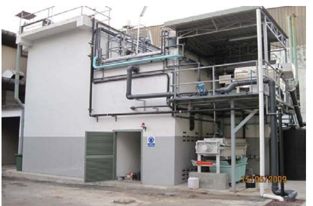
▲ Outdoor UASB reactor in Food Processing Plant, Shah Alam