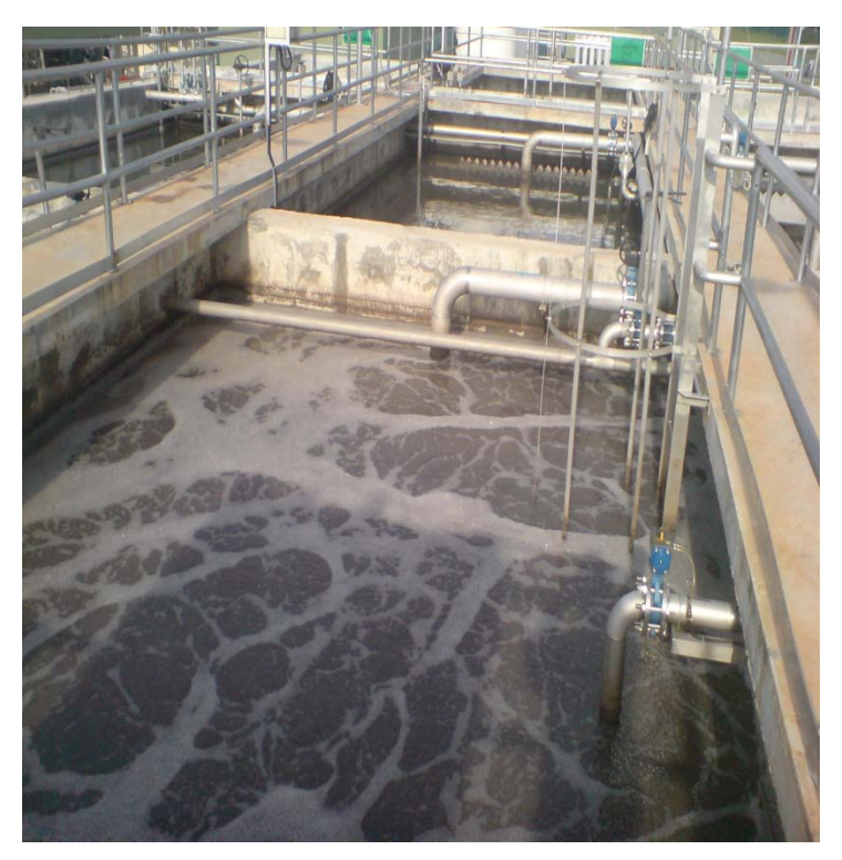
▲ AICAR reactor in petrochemical plant, Pasir Gudang

AICAR operates in continuous mode on wastewater feeding and discharging in batch treatment. AICAR improves large flow variation of batch system and suit to large flow systems.